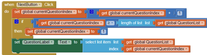
Figure 15-3. This block is executed when the user clicks NextButton

Next, trace what happens when the user clicks the Next button, using the blocks shown in Figure 15-3 .