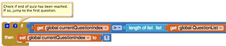
Figure 15-1. Using a comment on the if block to describe what it does in plain English

If you've completed a few of the tutorials in this book, you've probably seen the small yellow boxes within the blocks (see Figure 15-1 ). These are called comments . In App Inventor, you can add comments to any block by right-clicking it and choosing Add Comment. Comments are just annotations; they don't affect the app's execution at all.